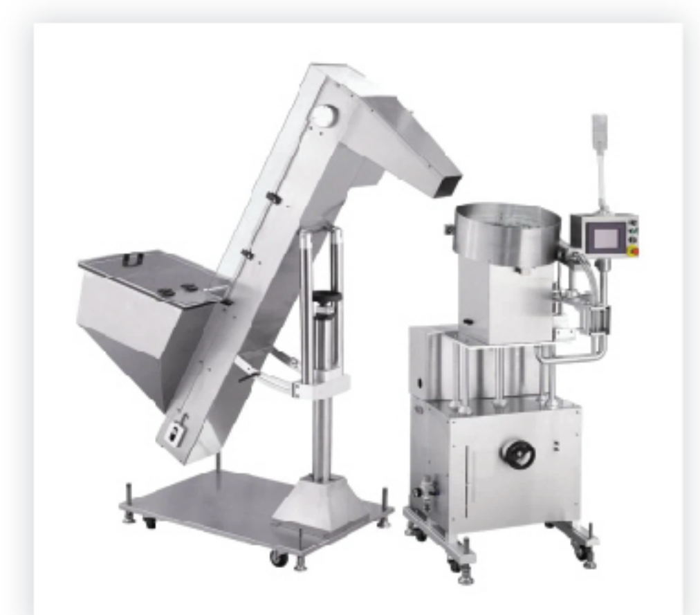
Canister Desiccant Inserter