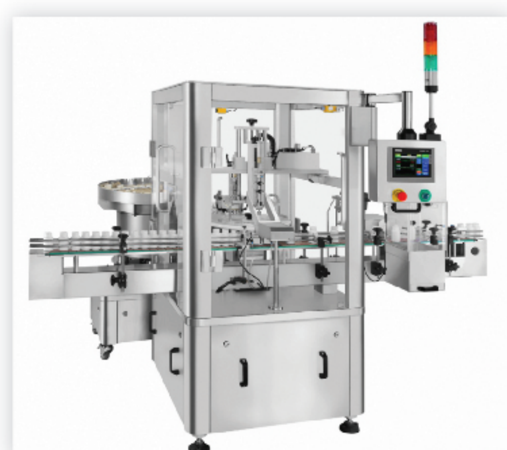
Plastic Foam Inserter